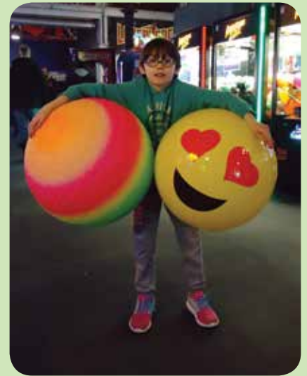
Prize winnings from Adventure Zone!