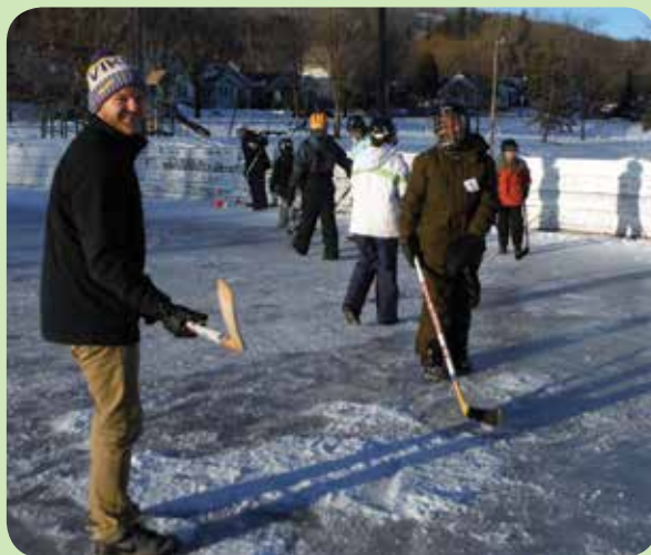
Boot hockey at the Merritt Community Club.