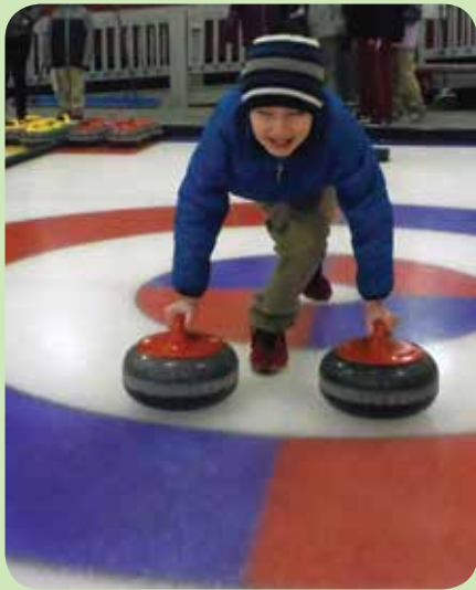
"Future Curling Gold Medal Olympian!"

With winter slowly coming to an end and the temperatures ranging from minus 40 to plus 40 in the last month, we've experienced a wide range of recreational opportunities for our children indoors and outdoors. Adding to the activities is our staff who are great role models with smiles on their faces, skills to keep everyone warm and happy, and new activities to play and experience. Play is inseparable from a child's life and is crucial in terms of social competence, creativity, sensory motor fitness, release of tension, and emotional stability. We like to play a lot and give our kids many fun recreational opportunities as you can see in the photos below.