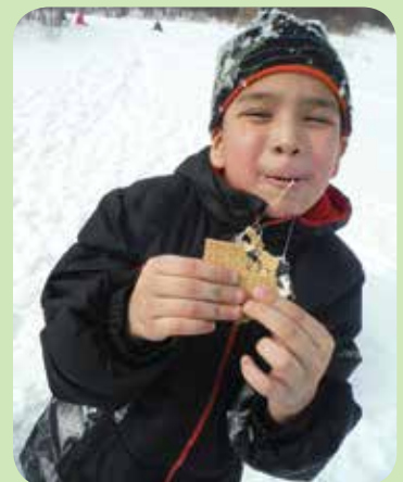
Nothing like a s'more in the snow!